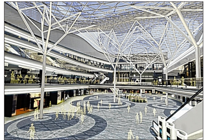
Classy glass: a CGI impression of Westfield London's vast, covered interior

If the reality equals the designers' and developers' vision, Westfield London is going to be simply stunning. It's a bold fusion of airy, detail-conscious design, fantastic retail names and more than a touch of Bond Street glamour. And, of course, for 7,000 people it's going to be a pretty amazing place to work.